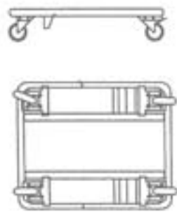
690-C Chair Cart