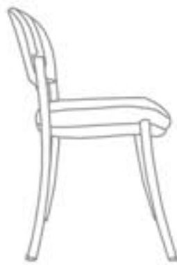
693 Armless Chair 33"H, 19.55"W, 21.5"D