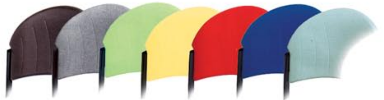
1P Black 2P Silver 3P Green 4P Yellow 5P Red 6P Blue 7P Teal