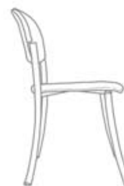
693P Arm Chair 33"H, 22.5"W, 21.5"D