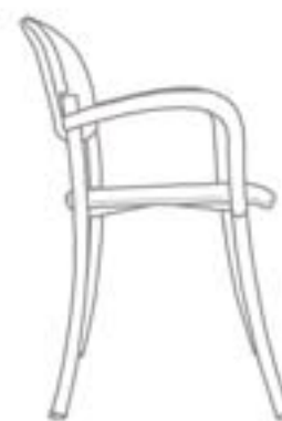
691P Arm Chair 33"H, 22.5"W, 21.5"D