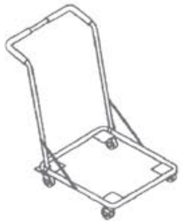
690-D Transport Dolly