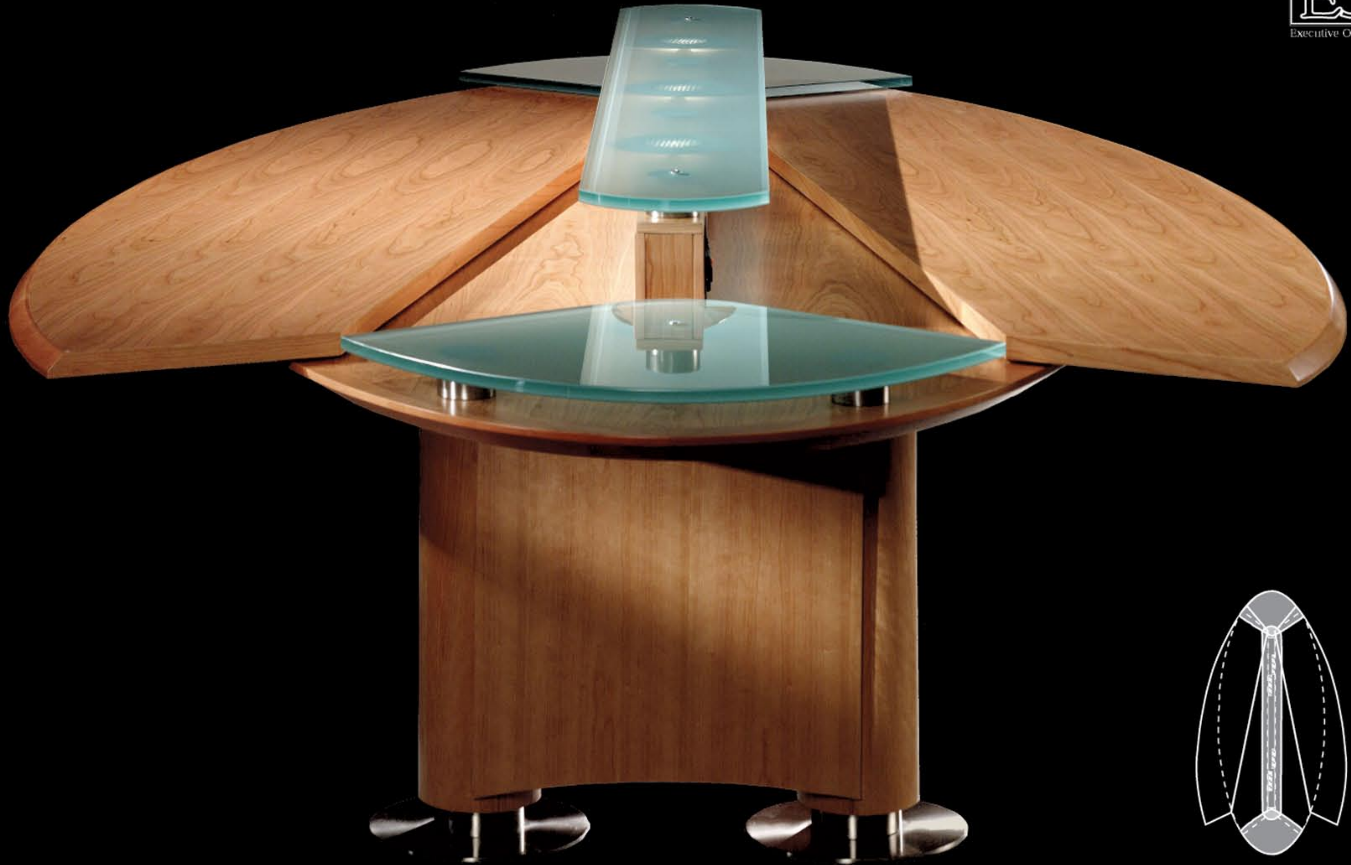
The Flight Table shown with its optional power island, glass ends and partially spread matching wings.