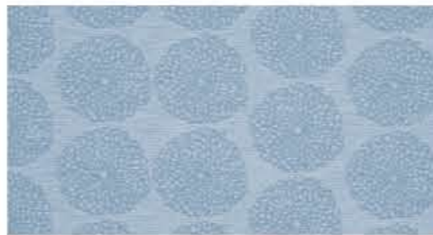
MUM - Repeat: 5.5" H, 3" V