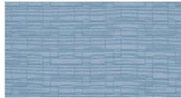
SOJOURN - Repeat: 4.5" H, 4.25" V