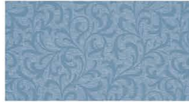
TENDRIL - Repeat: 14.125" H, 15" V