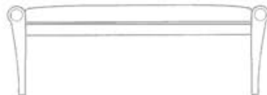
1212B-5 Two Seat Bench 18"H, 48.5"W, 20.5"D