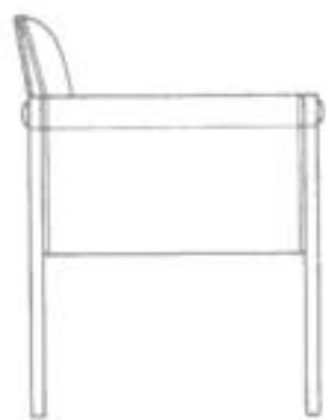
200M Arm Chair 33"H, 26"W, 26"D