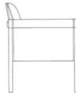
1210M Lounge Chair 32"H, 28.5"W, 26"D