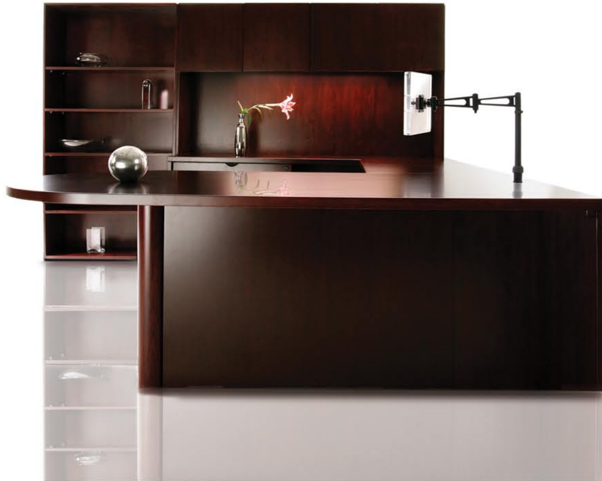
Architecturally inspired furniture designs with crystal clear hand rubbed hardwoods and veneers that look and feel right. Shown in Mahogany wood finish.

Nature's Elements' modular bookcases and lateral files are available in 30", 36" and 42" widths in two through five openings