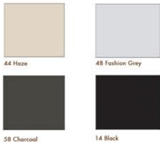
Above: Nature's Elements' contrasting solid color laminate finishes.

Nature's Elements' modular bookcases and lateral files are available in 30", 36" and 42" widths in two through five openings