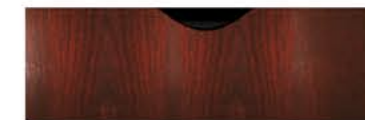
HPB black hood (standard)