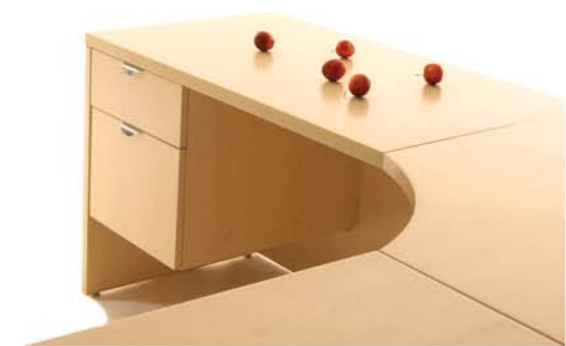
Drawer pedestals are available in both ¾ (shown here) and full height. Drawer pull options are shown at left. Finish shown above is #33 Natural Maple.