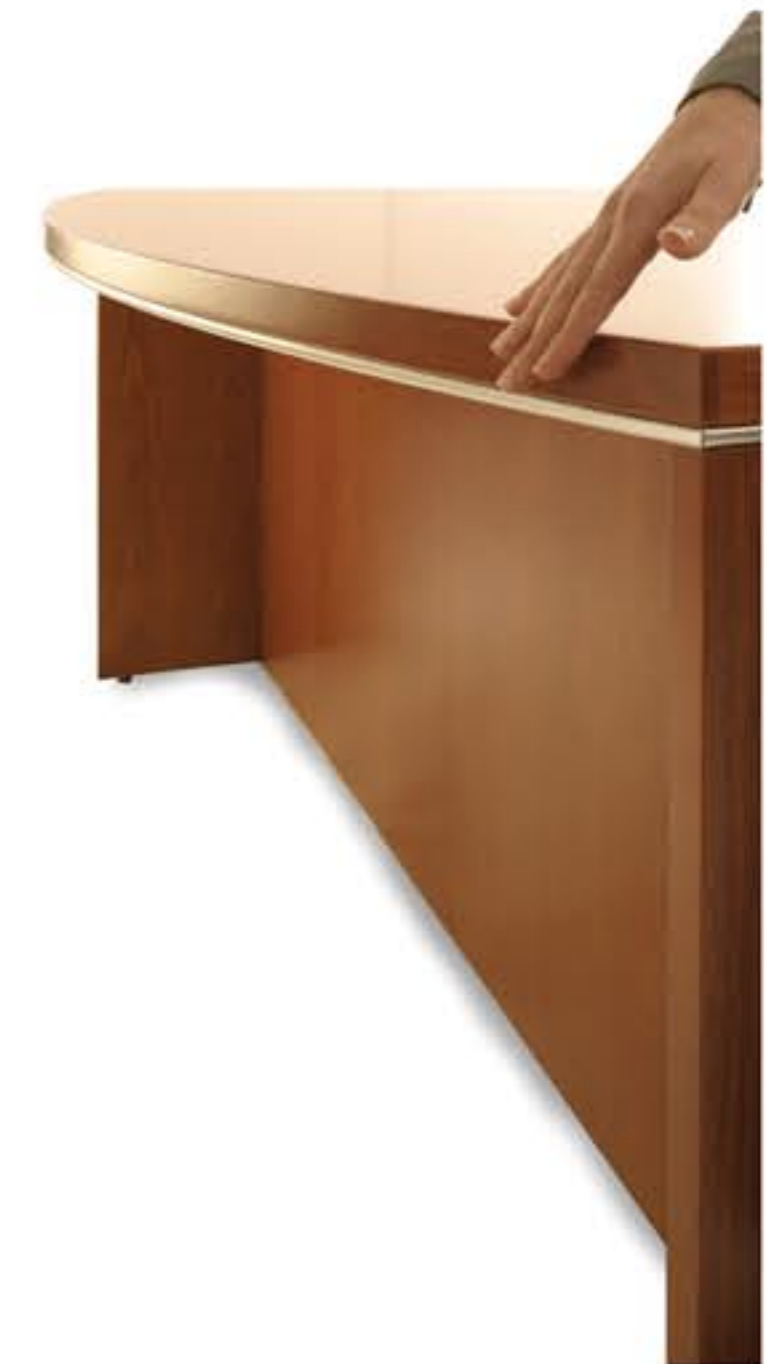
This collection features a uniform architectural hardwood edge for maximum configurability. It is shown here with an optional Arch (bow) shaped top and silver trim.