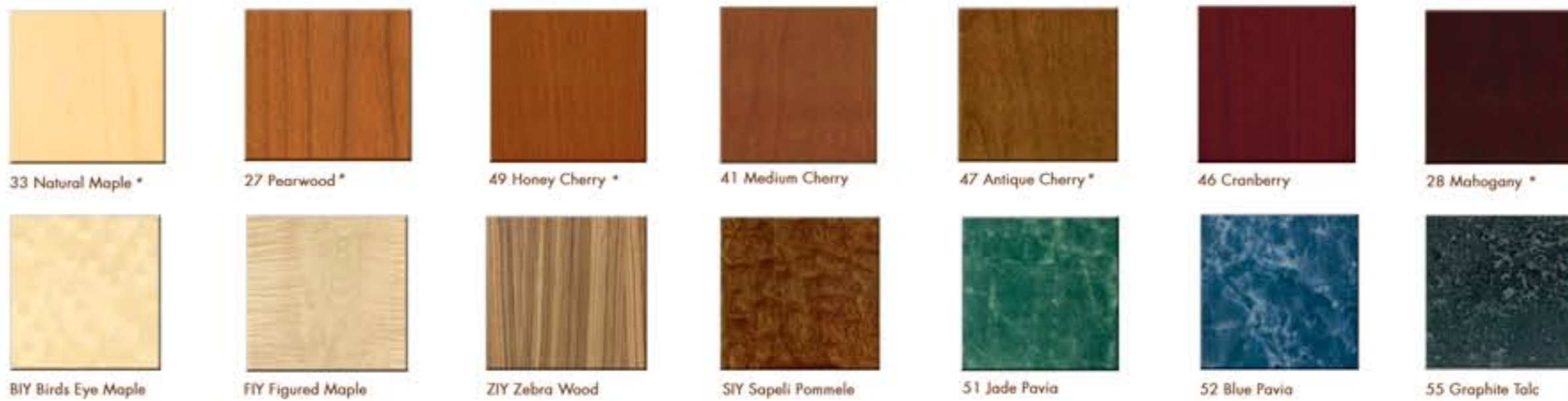
Top Row: Nature's Elements' seven standard wood finishes. * Asterisk indicates also available in laminate