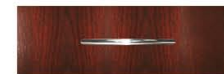
HPC silver hood