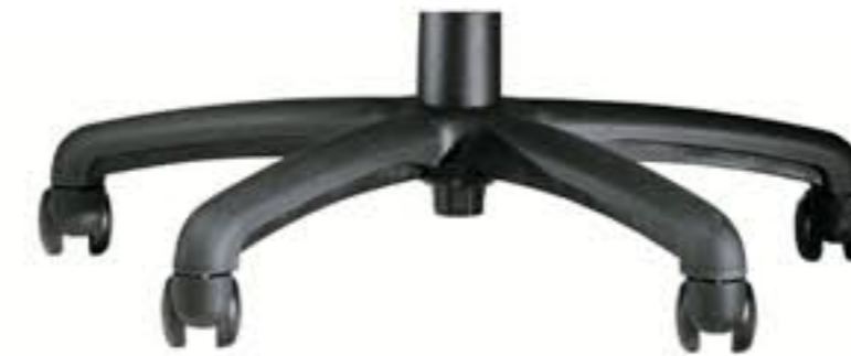
"A" Base Black Glass Filled Nylon