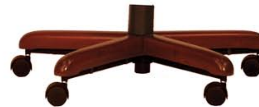
"W" Base Metal Reinforced Wood Base