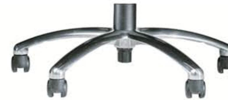
"C" Base Silver Powder Coated Aluminum