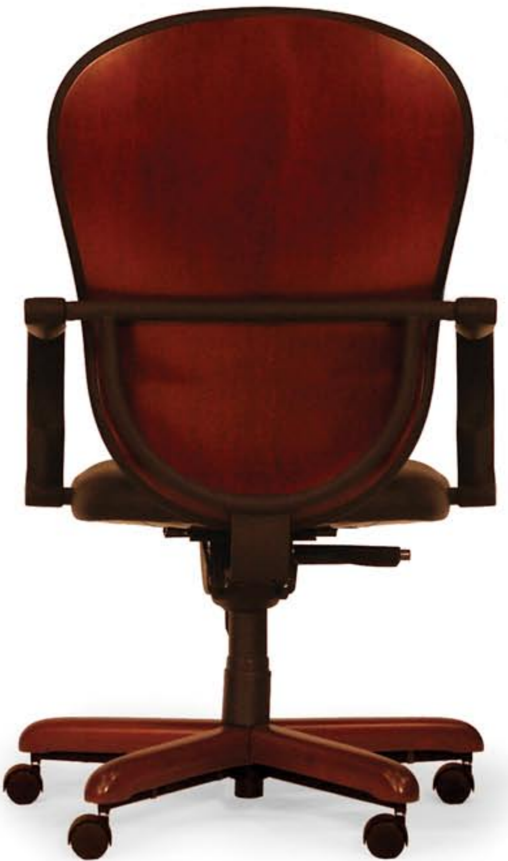
610M-WA Management Chair 41-44H, 25W, 32D

The flex action arms are molded soft textured urethane. They have a concealed spring steel insert that allows them to recline with the back (shown at left). The seat tilts only slightly, keeping the user's feet comfortably on the floor.