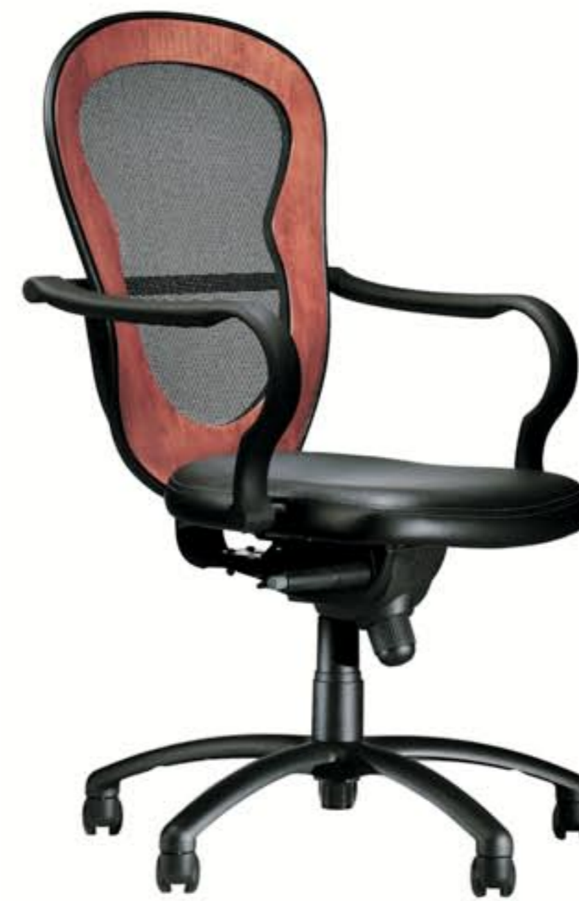
"B" Base Black Powder Coated Aluminum (shown)