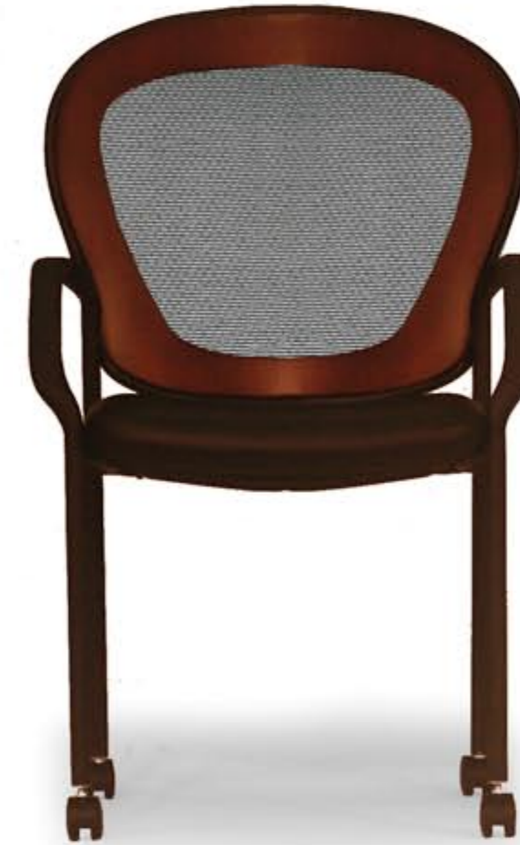
600M-AC Guest/Conference Chair 38H, 22.5W, 22.5D

The flex action arms are molded soft textured urethane. They have a concealed spring steel insert that allows them to recline with the back (shown at left). The seat tilts only slightly, keeping the user's feet comfortably on the floor.